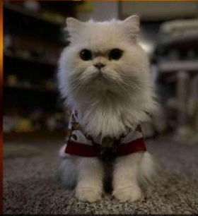
Look at handsome McFlurry! What a change from the matted shy boy that arrived at Safe haven.