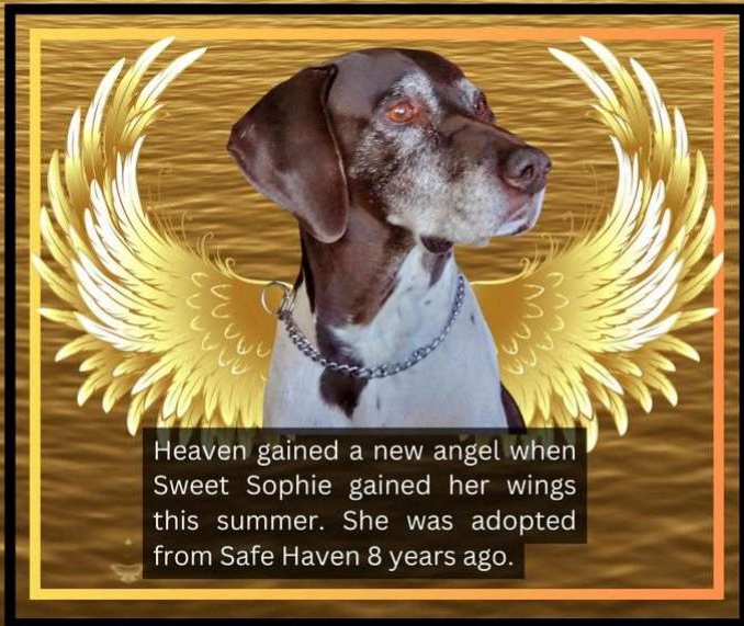
Heaven gained a new angel when Sweet Sophie gained her wings this summer. She was adopted from Safe Haven 8 years ago.