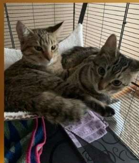
Burke and Sneazy, now Winston and Hazel, are delighted with their new home and their new humans!