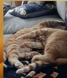
No, it's not an 8-legged cat. It's Happy (now Mufasa) and Grumpy (now Scar). Brothers and best frenemies.