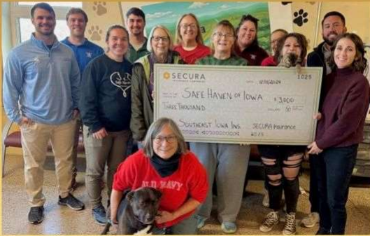
A big thank you to the folks at Secura Insurance, who stopped by for a tour and left us a "sizable" check!

We are feeling so blessed - we have had many great donations come in from our community!