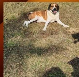
This is Baloo, our heartworm survivor. This is his favorite hill. Baloo loves to scootch and scritch his way down his hill as often as possible.