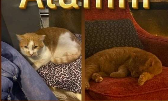
"Blaze is now named Phil from "Somebody Feed Phil" on Netflix. As a former feral cat, he's always "hungry". He is so lovable and sweet! Colby, now Roy, is still acclimating to his new home but, luckily, his new humans are willing to wait for him to come out of his shell.