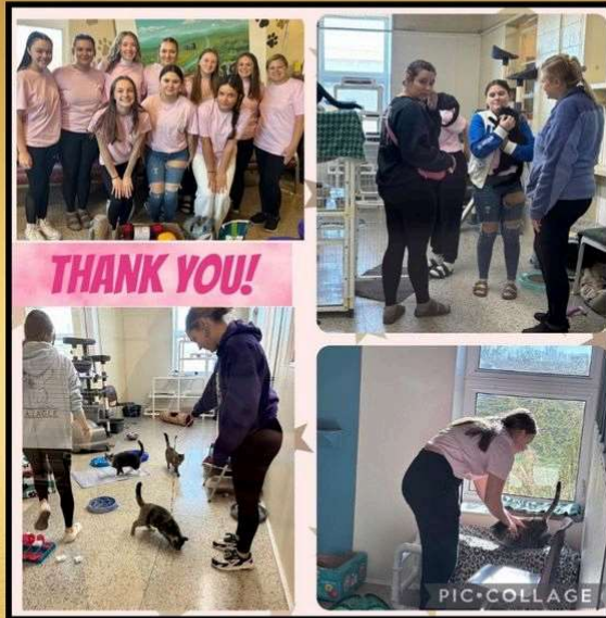
Students from Benton Community FCCLA Chapter came to help us out. After a few tasks were tackled... of course time was well spent getting their "kitty fix" with many very friendly, adoptable cats. Thanks to this group for the great help & box of donations they collected during a donation drive!