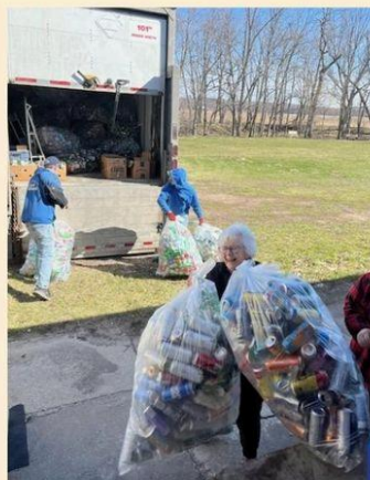
The Can Shed picking up nearly $500 worth of cans and bottles!