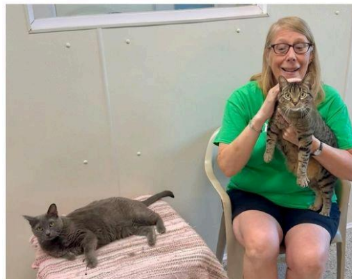
MIA AND PEANUT